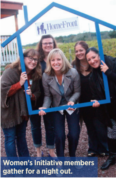
Women's Initiative members gather for a night out.