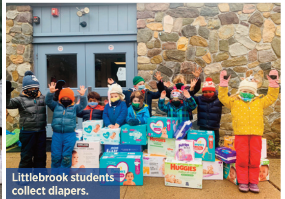
Littlebrook students collect diapers.