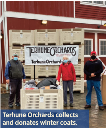
Terhune Orchards collects and donates winter coats.