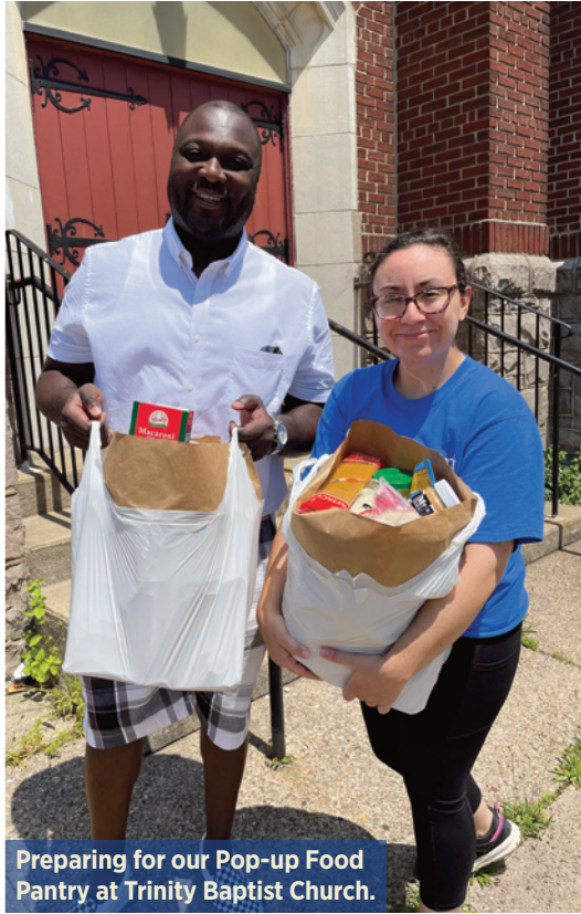
Preparing for our Pop-up Food Pantry at Trinity Baptist Church.