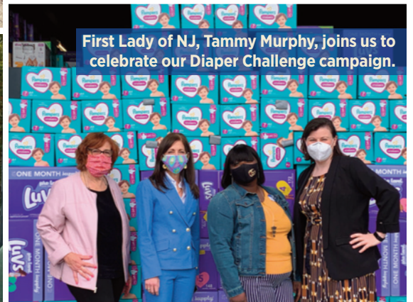
First Lady of NJ, Tammy Murphy, joins us to celebrate our Diaper Challenge campaign.