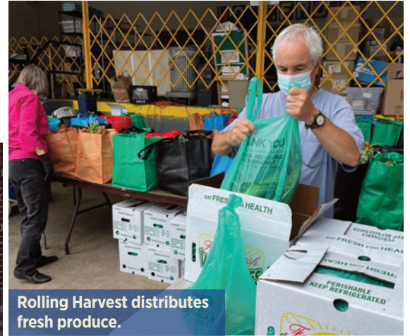
Rolling Harvest distributes fresh produce.