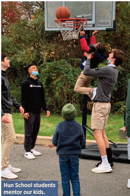
Hun School students mentor our kids.