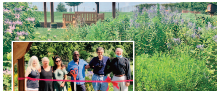
Our ribbon cutting celebration!

If you'd like to see our healing garden or tour our Family Campus, please email homefront@homefrontnj.org .